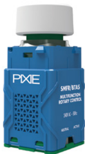
PIXIE Multifunction Rotary Control Part#: SMFR/BTAS**