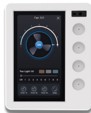
Pixie Touch Panel Part#: STP54BTAS**