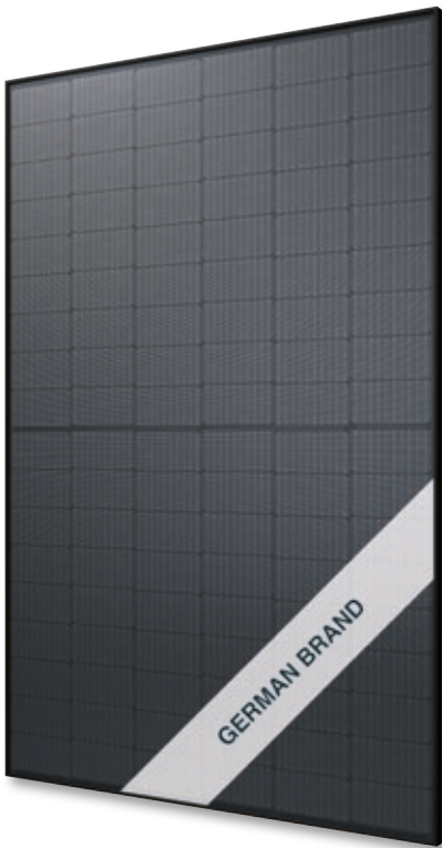
AXIblackbiperfect GXXL 430 - 440 Wp

High performance bifacial solar module 108 halfcell, glass/glass, N-Type TOPCon