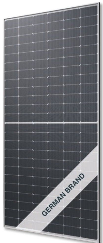
AXIbiperfect GXXL TS 565 - 580 Wp

High performance bifacial solar module 108 halfcell, glass/glass, N-Type TOPCon