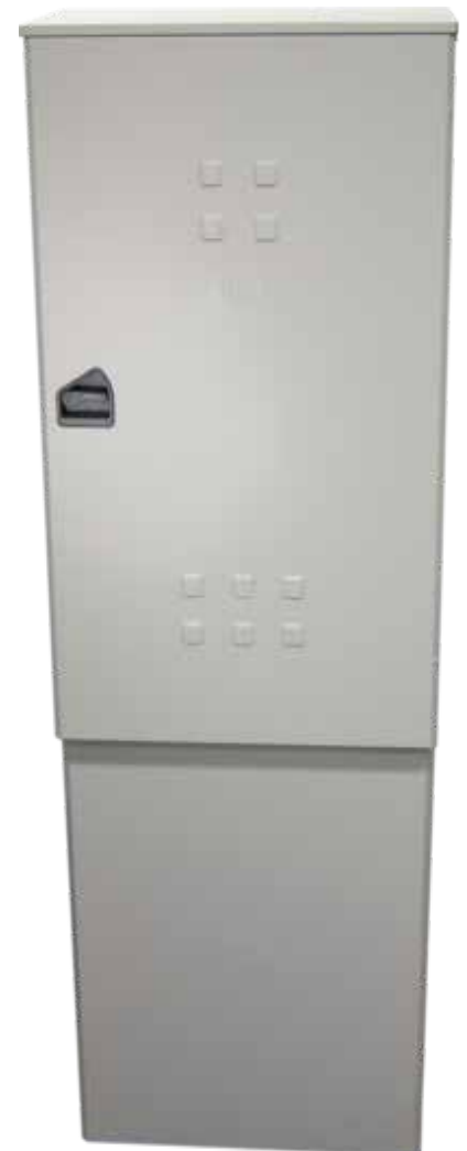
S20 with Roof & Plinth attached. All items are sold separately.