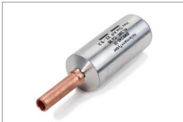
Bi-Metal link, BMK series.

More details: Click on article number in table.