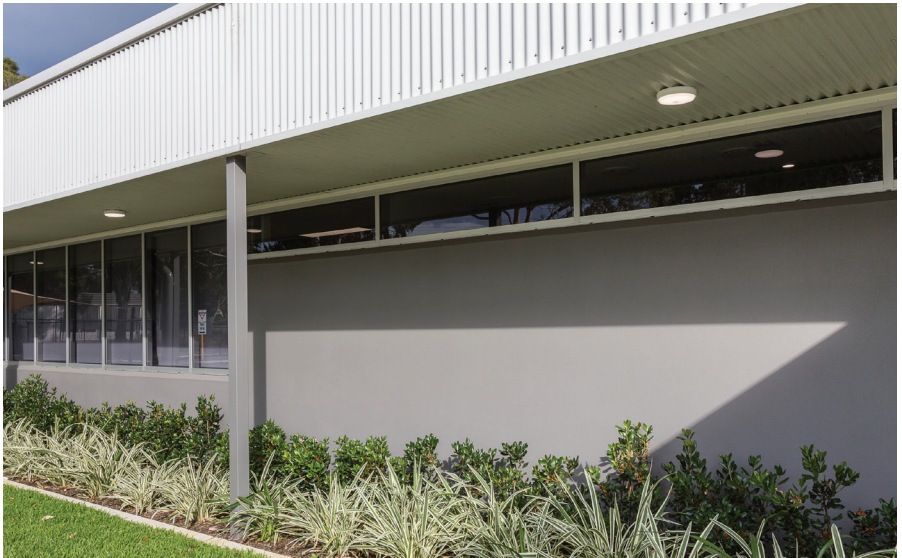
ACTIV BUSINESS SERVICES, BENTLEY, AUSTRALIA