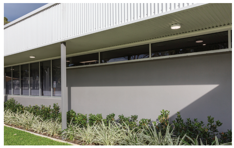
ACTIV BUSINESS SERVICES, BENTLEY, AUSTRALIA