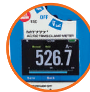
6000 Count Backlit TFT Colour Display