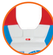
Red Light indicates detection of Non Contact Voltage (NCV)