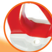
Meter includes flash light to light up area of test