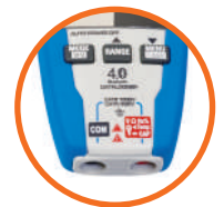
Rear entry of standard 4mm Test Lead Terminals