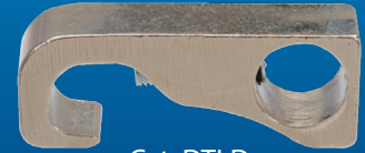
Cat: DTLD Non Captive Lock