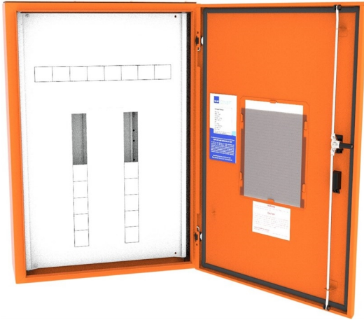
Representative Photo Only (actual product may vary based on configuration selections)