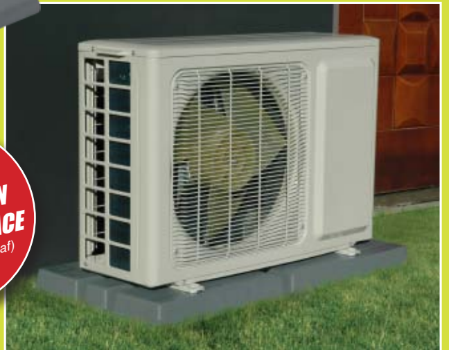
GREAT FOR AIR-CONDITIONERS, GENERATORS, PUMPS & MORE

SUITABLE FOR INSTALLATION ON ANY SURFACE (Install guide overleaf)