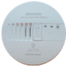
LIFCO240 240V AC CARBON MONOXIDE ALARM Rechargeable lithium battery backup (non-replaceable)