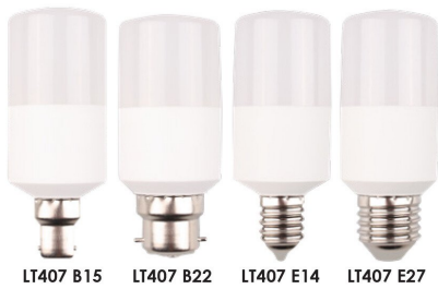
LT407 B15 LT407 B22 LT407 E14 LT407 E27