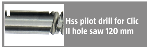
Hss pilot drill for Clic II hole saw 120 mm