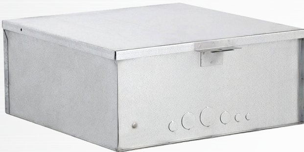
STD MB WL