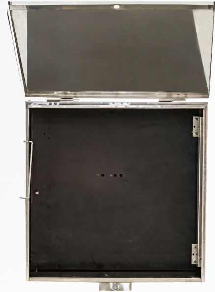
STD MB SS