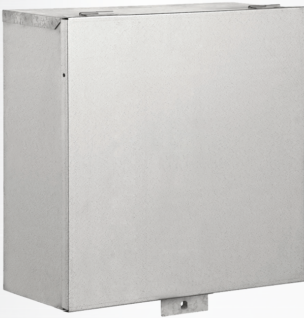
STD MB WL