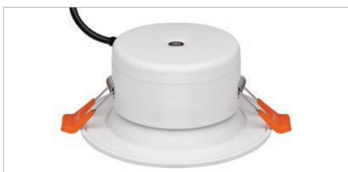
Supplied with rear heatsink cover for IC-F rating.