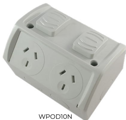
Integrated Cable Connection