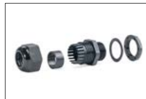
NG series, breakout view.