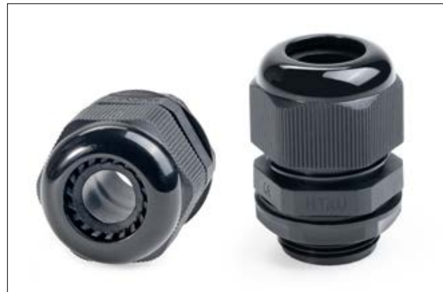
Nylon cable gland, NG series.