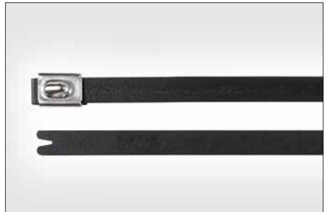
Stainless Steel Cable Ties, coated