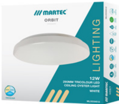
12W Illustration only shown for packaging example.