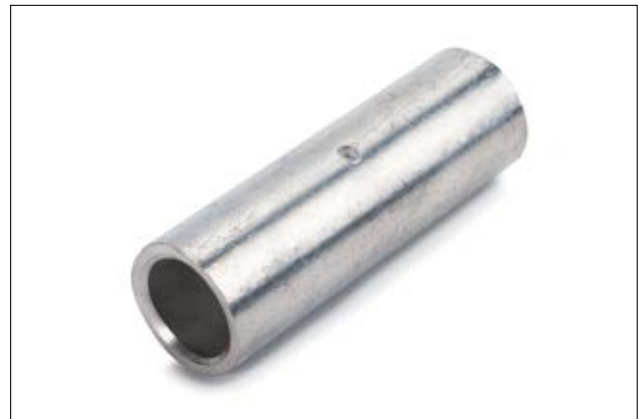
Copper Link, CS series.