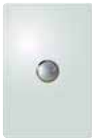
DIMPRKBS on glass-look switch plate (example)