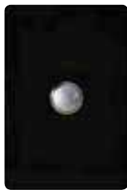
DIMPRKBS on a black switch plate (example)