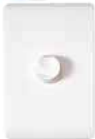
DIMPR knob on a white switch plate (example)

Set to your choice of green, blue or off.