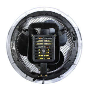
High Performance Ball Bearing Motor