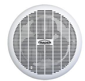
Easy to Clean Grille