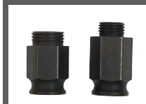
SET OF TWO CLIC ADAPTERS