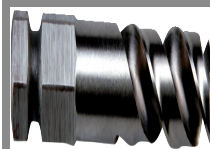
HSS PILOT DRILL FOR BI-METAL 8 % COBALT HOLE SAWS