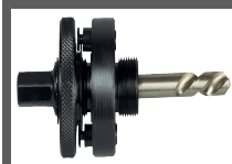
Arbors for bi-metal hole saws standard