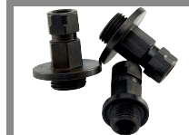
Set of 3 adapters standard hole saw ø > 30 mm