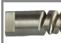
HSS pilot drill for BIZ 700 896 and BIZ 700 897 arbors