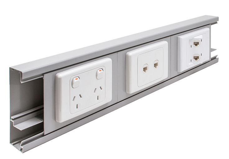
FULL SIZE SECTION