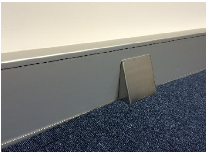
FFD10012DCRSK Skirting to Duct Transition Kit