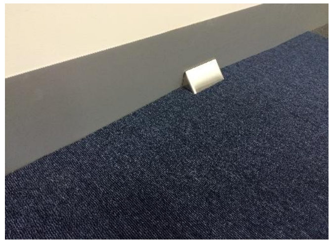
FFD10012DCRWAL Wall to Duct Transition Kit