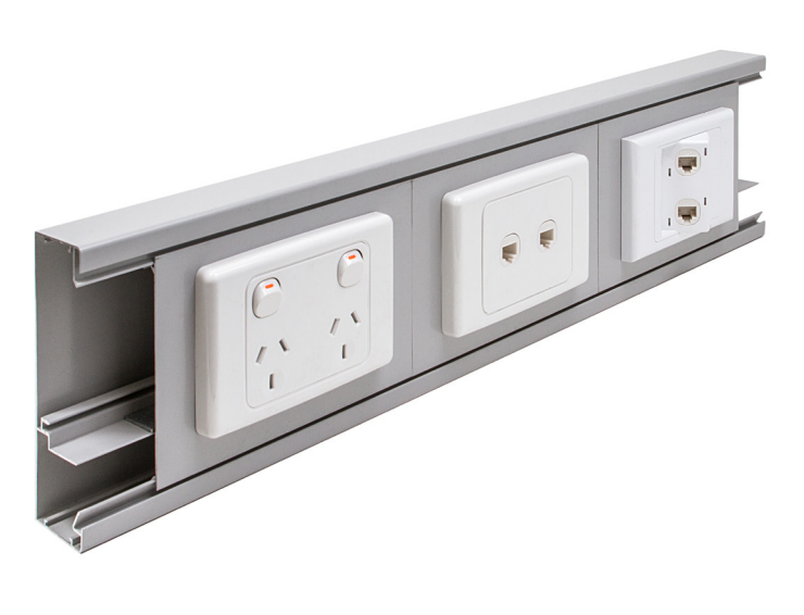
FULL SIZE SECTION