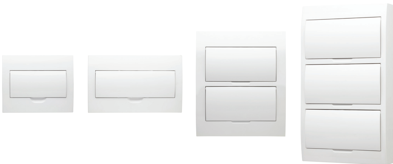
SFRSLC12 | Load Centre | 12 Pole |