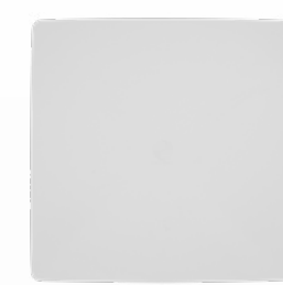
Square grille with white finish