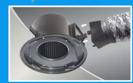
Long clip-in spigot makes installation and duct connection easier.