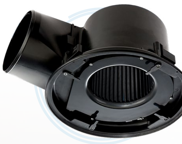
Rapid Response fan body available in 8 inch and 10 inch models.

The Rapid Response ceiling mounted header box fan features a fully optimised inlet cone and centrifugal impeller that maximises air pressure and ensures rooms are quickly cleared of steam and unpleasant odours. Its clever design includes a unique swing clip and removable spigot that makes it very easy to install.