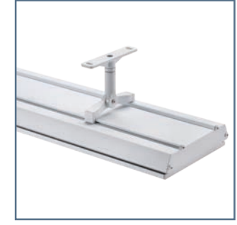
Suitable for both direct mounting & suspending.