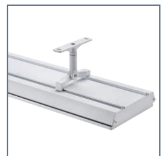
Suitable for both direct mounting & suspending.