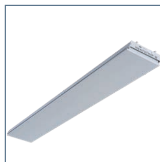
Corrosion resistant "offwhite" slimline heater.