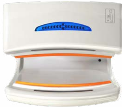
Top View (White Model)