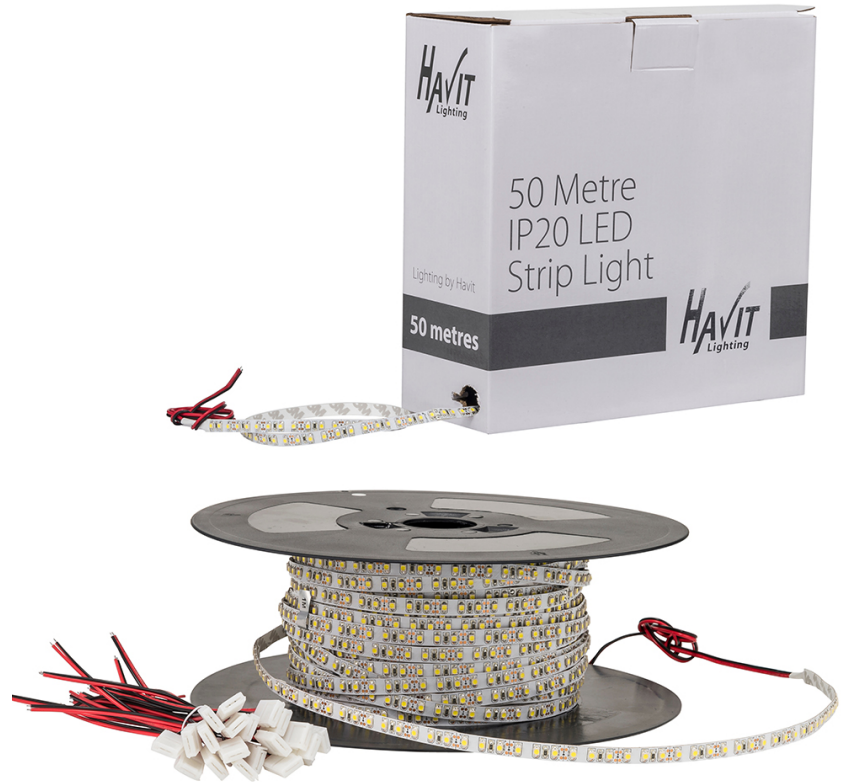
Box Contains 25x Ezi Tail Connectors