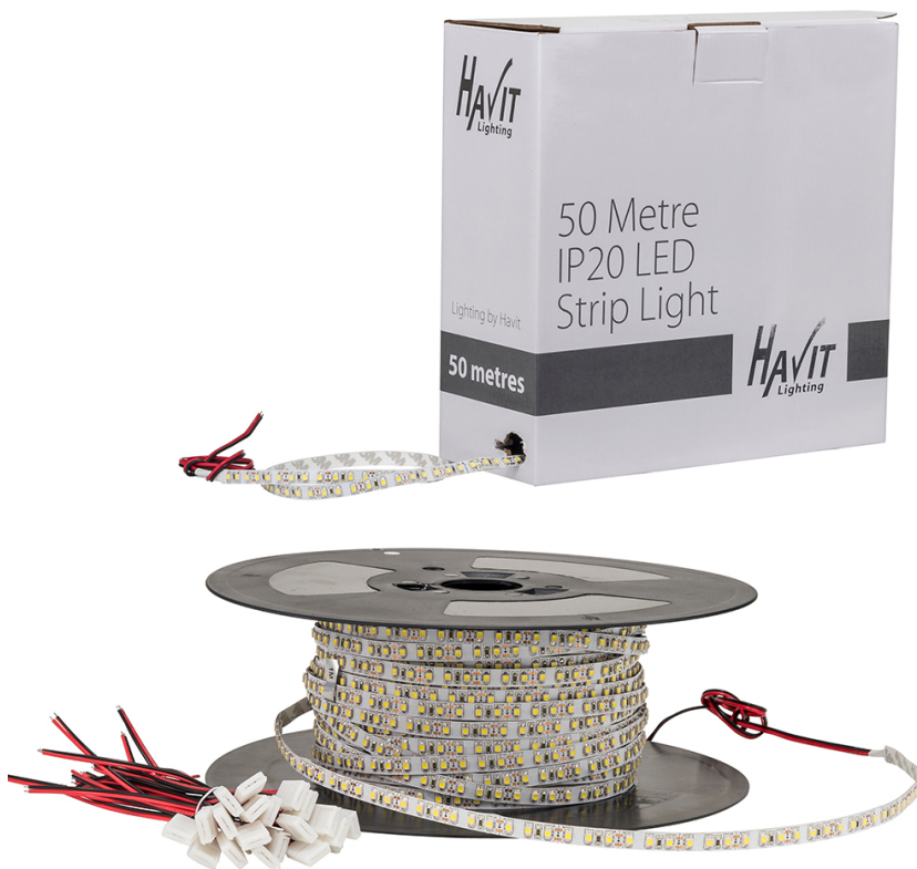
Box Contains 25x Ezi Tail Connectors