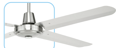
48": STAINLESS STEEL 316