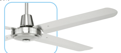
52": STAINLESS STEEL 316