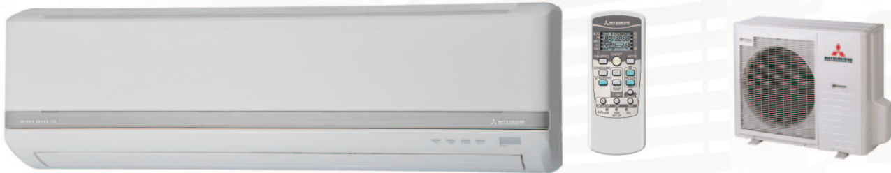
SRK63ZK-S / SRK71ZK-S