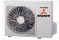
SRK20ZJX-S / SRK25ZJX-S / SRK35ZJX-S