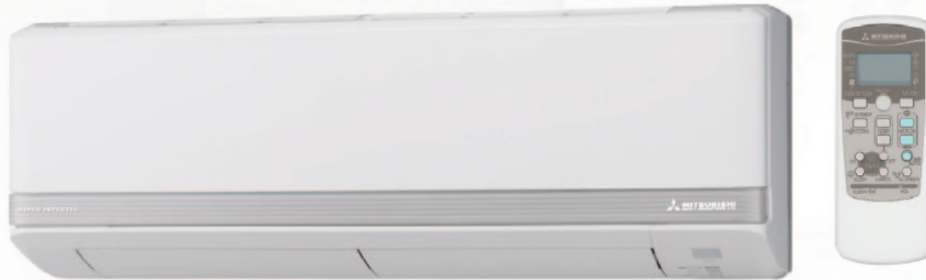
SRK20ZJX-S / SRK25ZJX-S / SRK35ZJX-S / SRK50ZJX-S1 / SRK60ZJX-S1