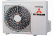
SRK50ZJX-S / SRK60ZJX-S