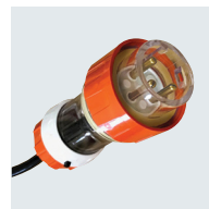
20A Captive Round Pin