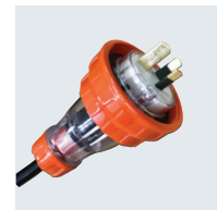
10A Captive Flat Pin