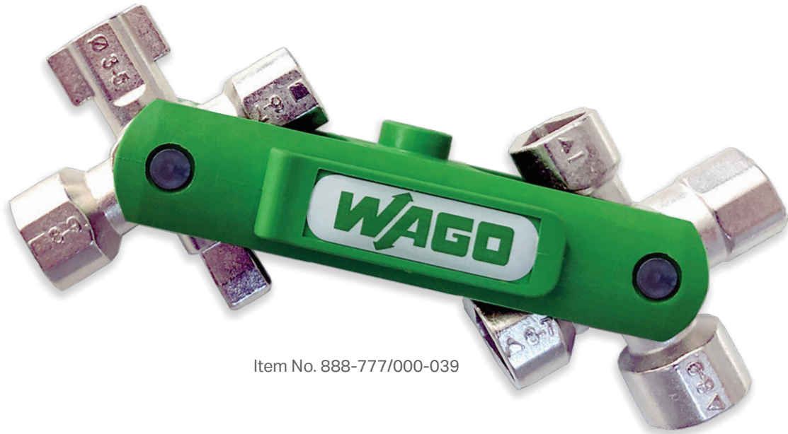
Item No. 888-777/000-039