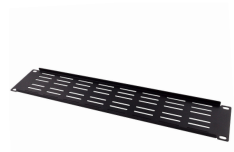
XXRU 19" VENTED BLANKING PANEL

PART NUMBER : BP-XX (XX = Number 01, 02, 03, 04)