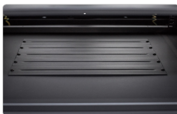
Ample cable entry glands at the bottom