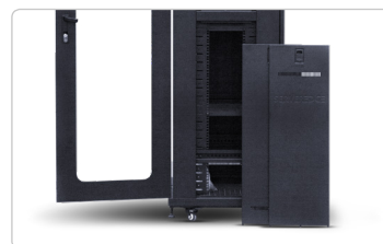
Removable side panels