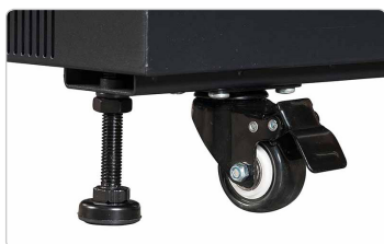
Pre-installed lockable castors and stabilising feet