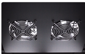
Included roof fan kit