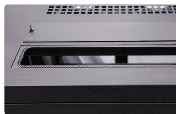
Nylon bush lining in all cable entry glands to protect from wear and tear