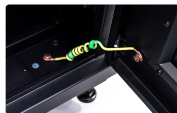
Earth straps on front and rear doors