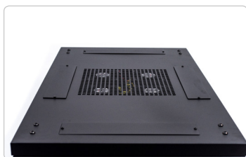
Multiple cable entry glands at the top