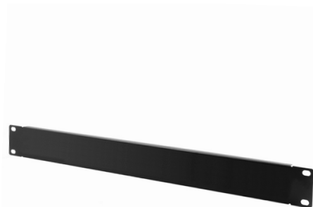
XXRU 19" BLANKING PANEL

PART NUMBER : CB-1P-BK-50 , CB-1P-BK-100