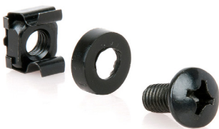
Heavy Duty M6 Cage Nuts, Washer & Screw Set : Pack of 100 : BLACK

PART NUMBER : CB-1P-BK-50 , CB-1P-BK-100