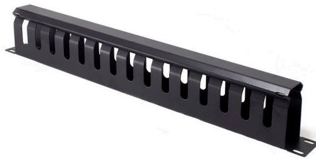
1RU HORIZONTAL 12 SLOTS METAL CABLE MANAGEMENT RAIL