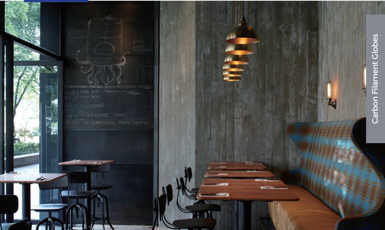
Carbon Filament Globes