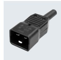
15A IEC (C20)