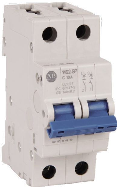
Representative Photo Only (actual product may vary based on configuration selections)