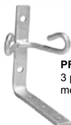
PFBKT3 3 phase pole mount bracket