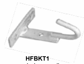
HFBKT1 1 phase wall mount bracket

Pole or house mounted fuse holders and accessories. 100 amp single phase, "pig-tail stick" operated, service fuse for house or pole mounting.