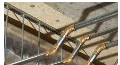
Suspension of ducting for heating/ventilation/air conditioning