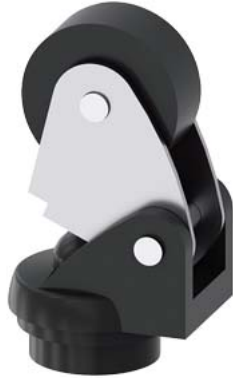
Actuator head for position switch 3SE51 Roller lever Metal lever and Plastic roller 22 mm