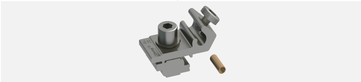
PV-ezRack Grounding Lug Part No.: EZ-GL-ST