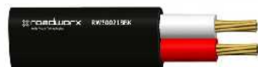
Cable Construction Drawing